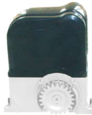
Auto Sliding gates Motor