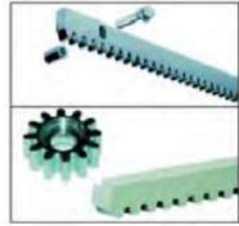
Rack & Pinion